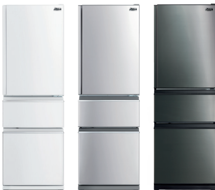
White Stainless Steel Black Stainless Steel

Keep meat and fish fresher for longer without having to freeze them. The Supercool Chilling Case is ideal for storing fresh meat for up to seven days and fish for up to five days without the need of a freezer.