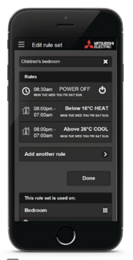
Either choose to edit an existing rule or create a new one.