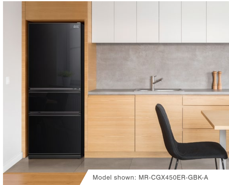
Model shown: MR-CGX450ER-GBK-A

Note: Variances in product dimensions may occur. Please see operation manual for installation requirements.