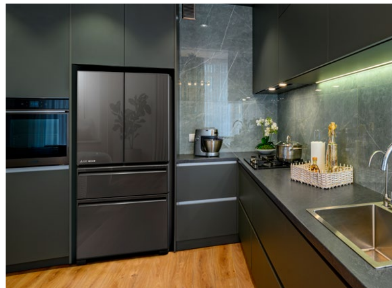
Model shown: MR-LX564ER-GDS-A

MF-U218ET 542W x 1496H x 650D 218 Litres