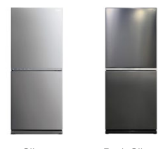
Silver Dark Silver Available at selected retailers only.