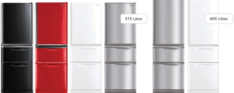
MR-C375G 600W x 666D x 1678H mm

Available in Onyx Black, Red, White or Stainless Steel*.